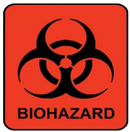
Figure 1: Biohazard Warning Symbol

As a general rule, the location of the posting is predicated by how access is gained to the area where biological hazards are used. In most cases, the door to any laboratory containing an infectious agent should have a biohazard warning symbol posted. In addition, postings should also be displayed in other areas such as biological safety cabinets, freezers, or other specially designated work and storage areas or equipment where potentially infectious agents are used or stored. All individual containers of biological agents should also be labeled to identify the content and any special precautionary measures that should be taken.